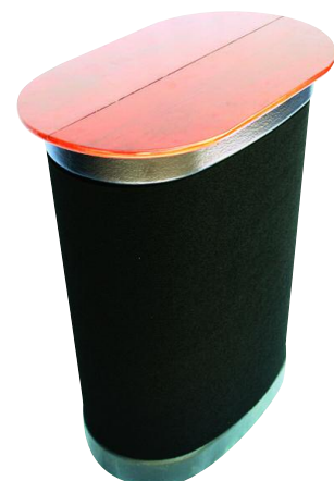
Podium Kit with Optional Wooden Hardwood Top