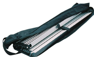
Magnetic Channel Bars