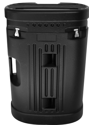
Premium Oval Case