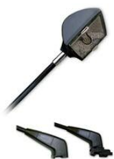
200 watt Halogen Light